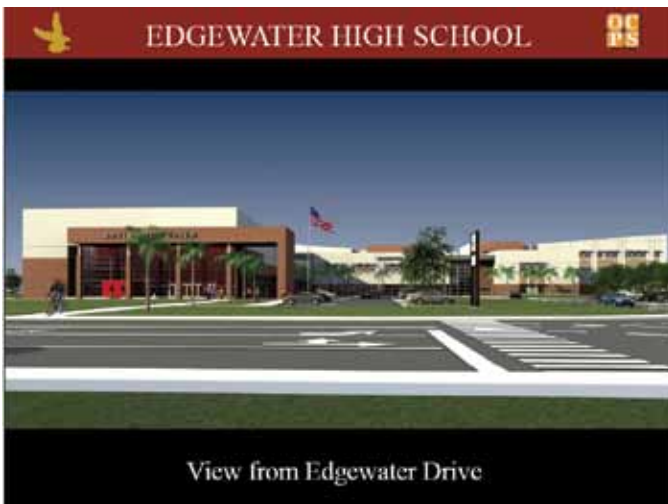
View from Edgewater Drive

If you are not aware of the changes to the campus, I'll do my best to describe some of the design highlights. The new main entrance to the school will be at Par Street as shown in the picture below. You can see in this picture, the new auditorium as well as the main entrance. That entrance is to a long corridor that acts as the spine of the main classroom buildings.