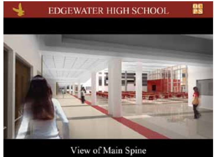
View of Main Spine

the classrooms, a central interior that unifies the various classroom wings.